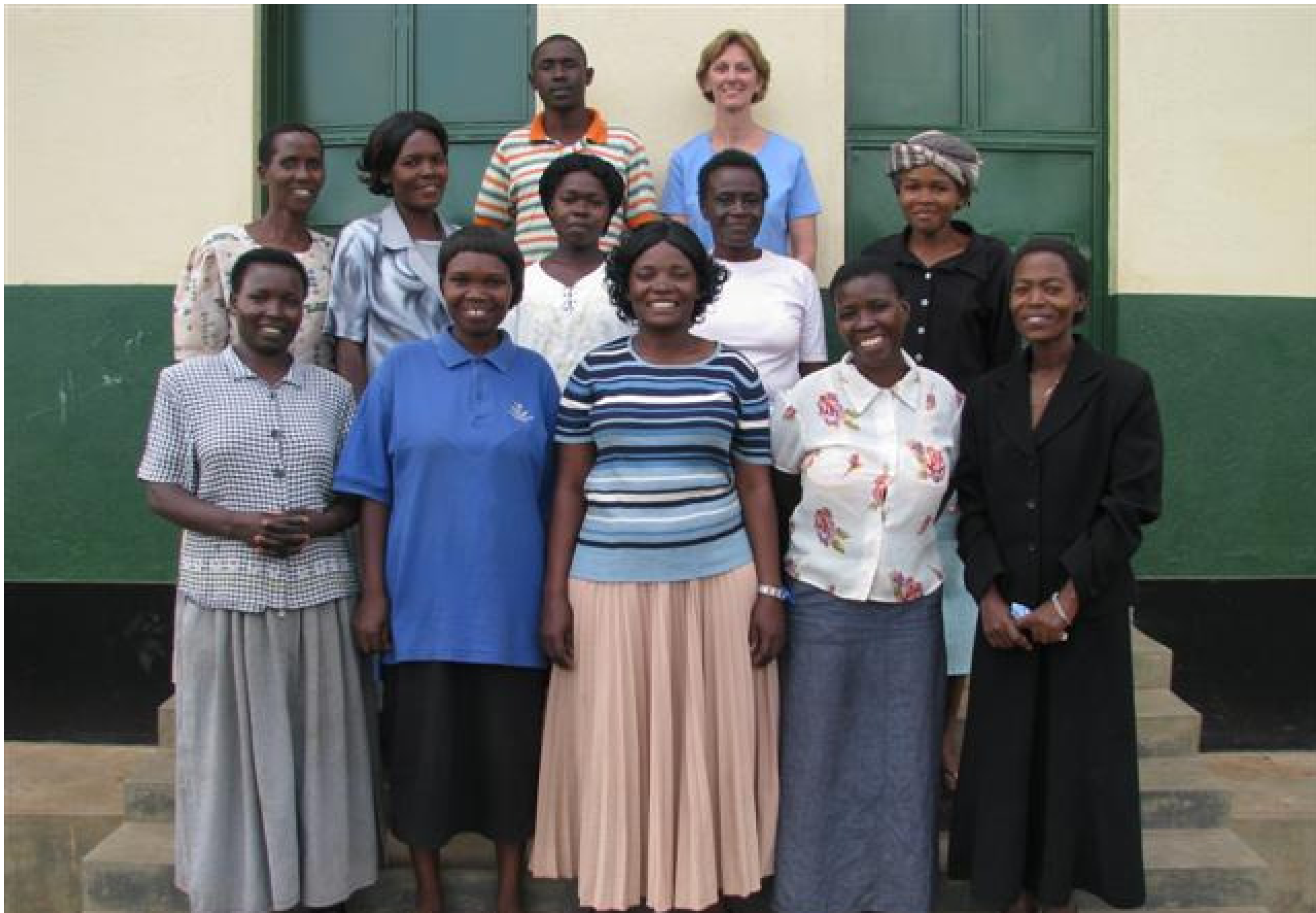
BULAMBULI WIDOW'S ASSOCIATION STAFF WHO ADMINISTER WMI PROGRAM