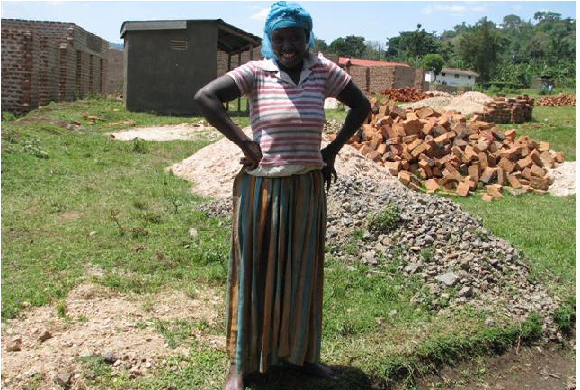
WMI BORROWER BUILDING A NEW SHOP IN AN AREA WITH OTHER NEW BUILDINGS BELONGING TO WMI BORROWERS.