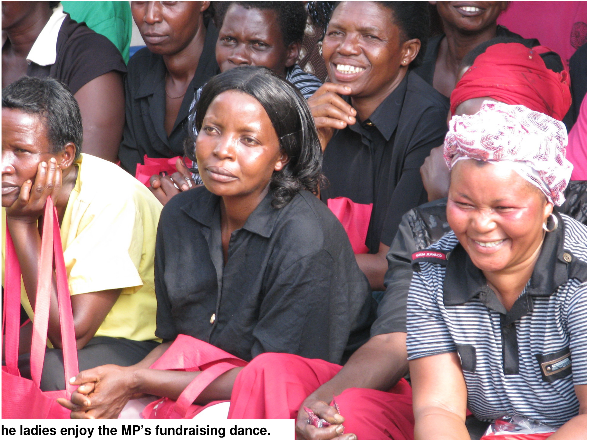
he ladies enjoy the MP's fundraising dance.