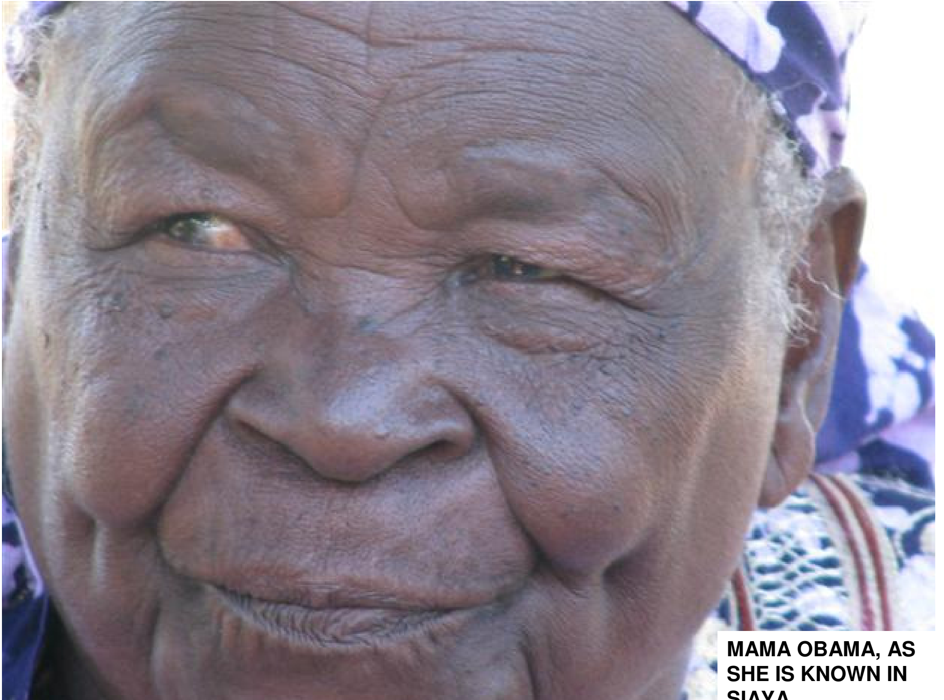
MAMA OBAMA, AS SHE IS KNOWN IN SIAYA