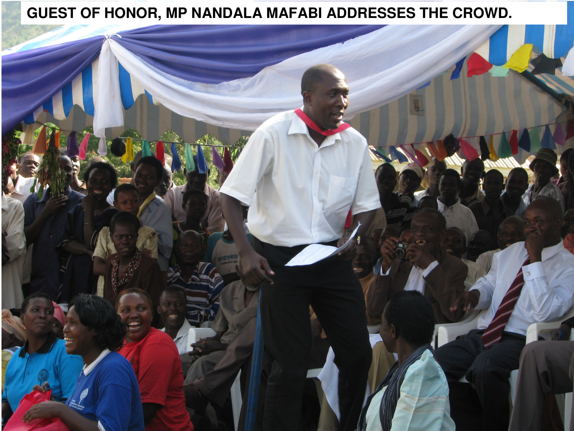
GUEST OF HONOR, MP NANDALA MAFABI ADDRESSES THE CROWD.