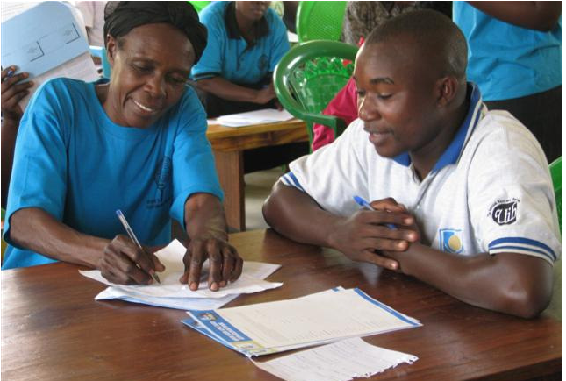
POSTBANK STAFF COMES OUT TO THE WMI BUILDING TO HELP BLUE GROUP BORROWERS FILL OUT LOAN FORMS