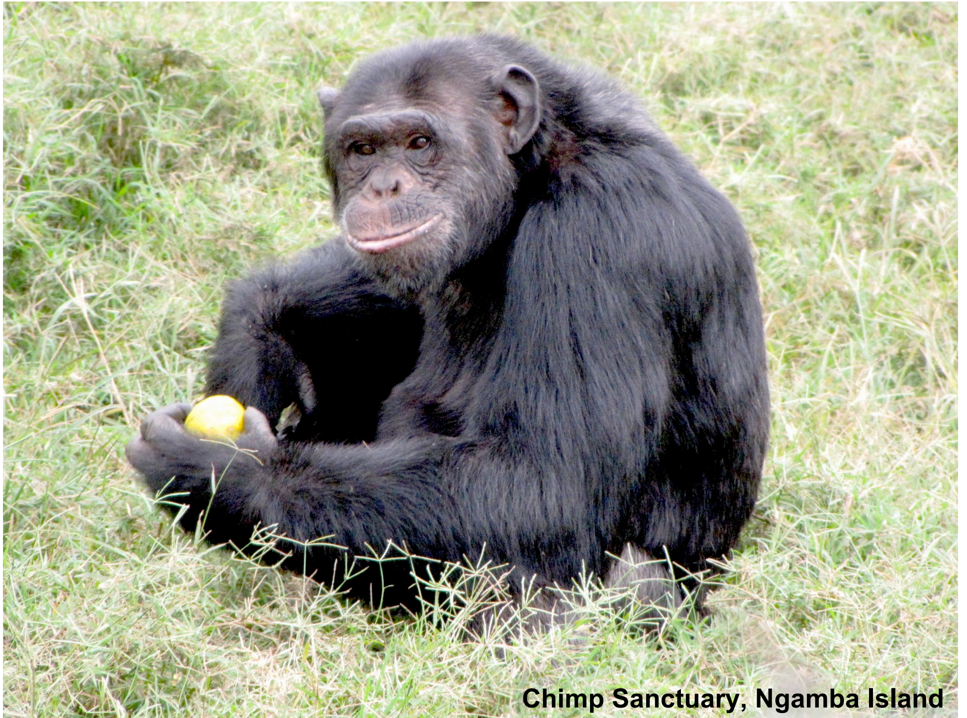
Chimp Sanctuary, Ngamba Island