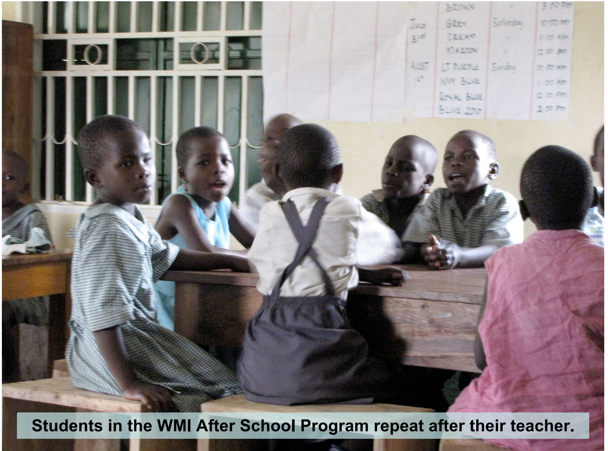
Students in the WMI After School Program repeat after their teacher.