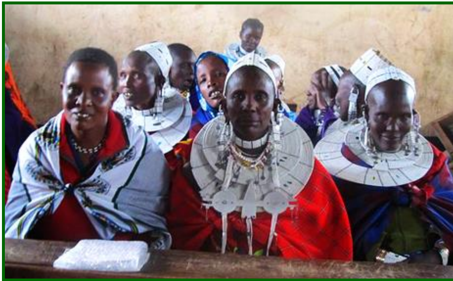
Nainokoaka villagers listen intently during training session